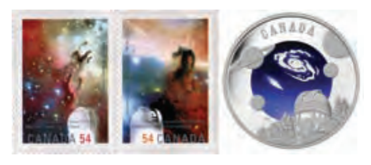
Figure 6 — Canadian IYA postal stamps featuring the domes of the DAO Plaskett and CFH Telescopes superposed on CFHT images and the Royal Canadian Mint $30 silver Commemorative coin.

Canadian astronomical imagery and themes also inspired the artists at Canada Post and the Royal Canadian Mint, who produced stunning postal stamps and a silver $30 IYA commemorative coin.