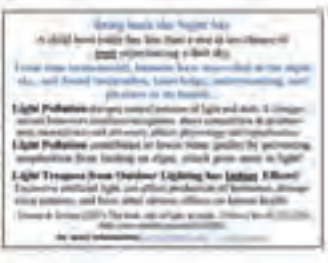
Figure 3 — One of nine light-pollution cards created by RASC Victoria Centre.