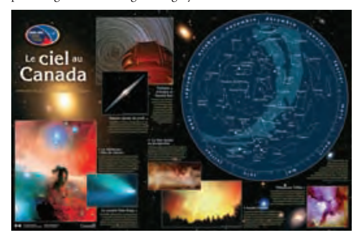
Figure 8 — The French version of an educational poster widely distributed by NRC.

For instance, the National Research Council updated their popular Canadian Skies poster, with its information about Canadian ground-based astronomy, and activities for teachers and students. Throughout Canada, at teachers' conferences, in schools, and at public events, NRC distributed 11,441 posters (twice as many as during 2008), experienced a 30-percent increase in Web hits, and distributed 1100 RASC-FAAQ Star Finders . Emphasizing Canada's contributions to space astronomy missions, and thus nicely complementing the NRC poster, the Canadian Space Agency produced a new educational poster, Secrets of the Night Sky , to commemorate IYA. Since distribution began in June, students, teachers, and the public have received 6300 copies. Together these posters are reaching hundreds of thousands of young Canadians, providing another strong IYA legacy.