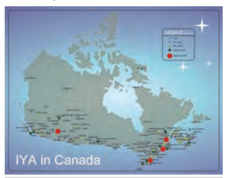
Figure 1 — Galileo Moment geographical distribution across Canada.

Early on, we adopted a simple way of summarizing progress towards our overarching goal of offering an engaging astronomical experience, a "Galileo Moment (GM)" of personal astronomical discovery, to every Canadian, thereby using the wonder of the night sky to inspire an interest in the cosmos and in science in general. The fairly inclusive definition was meant to encourage both traditional (e.g. star parties, visits to planetaria, etc.) and non-traditional (e.g. attending art or musical events with strong astronomy content) approaches to help people reconnect with the cosmos. Event organizers reported the Galileo Moments achieved (that is, attendance), and a simple counter on our bilingual Web site increasingly captured attention as 2009 progressed. Formally, we celebrated passing the one million goal on October 27, but when all the late reports of earlier events came in, we now know it actually occurred much earlier in the year. By the end 1.93 million GMs were recorded throughout Canada.