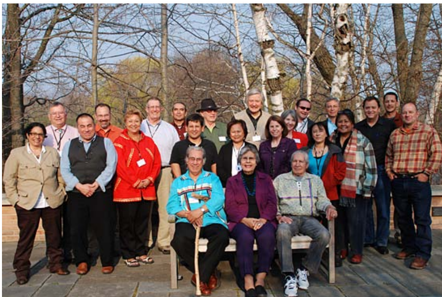
Wisdom keepers from across Indian Country gather at GEM Wingspread Conference in Racine, Wisconsin, May 9-11, 2011.

Sharing personal stories of how indigenous knowledge helped inform and guide their individual calling and journey along life's pathways, participants spoke from the heart. Inspired by respect and responsibility as guardians of Mother Earth, their voices collectively articulated challenges and changes needed to protect and honor all interdependent elements bestowed by the Creator to sustain life. Embracing a deep spiritual connection to Nature, a "Seven Generations" approach of responsibility to future generations of all life forms in perpetuity was a common thread woven through the fabric of discussion on indigenous knowledge-based lifeways for sustainability.